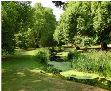
Saffron Walden – Audley End House garden.

Our website www.hundredparishes.org.uk includes an Article on Gardens and the What's On page shows dates of specific local open gardens.