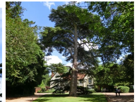
Much Hadham – Cedar at The Old Rectory