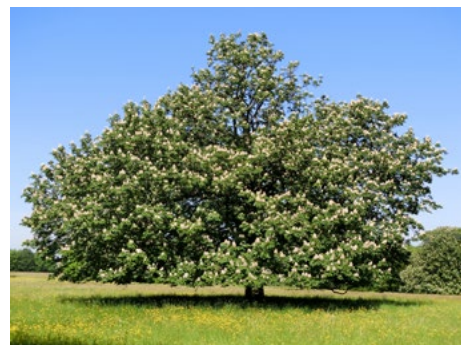
Steeple Bumpstead – Horse Chestnut tree in Moyns Park