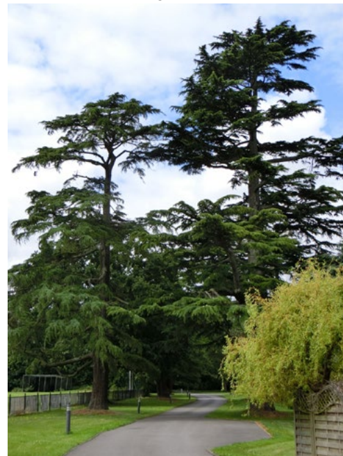
Stansted Mountfitchet – Cedar trees at Hargrave House.