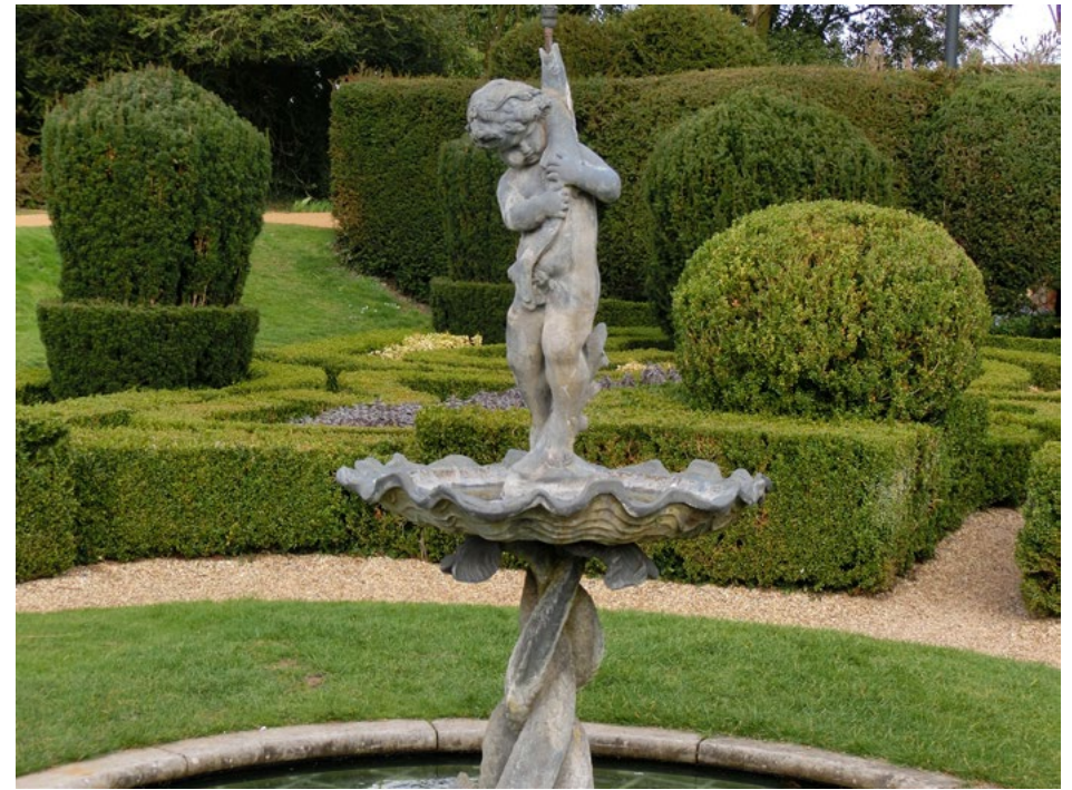
Saffron Walden – Bridge End Gardens.