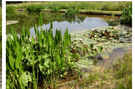
Steeple Bumpstead – pond in an open garden.